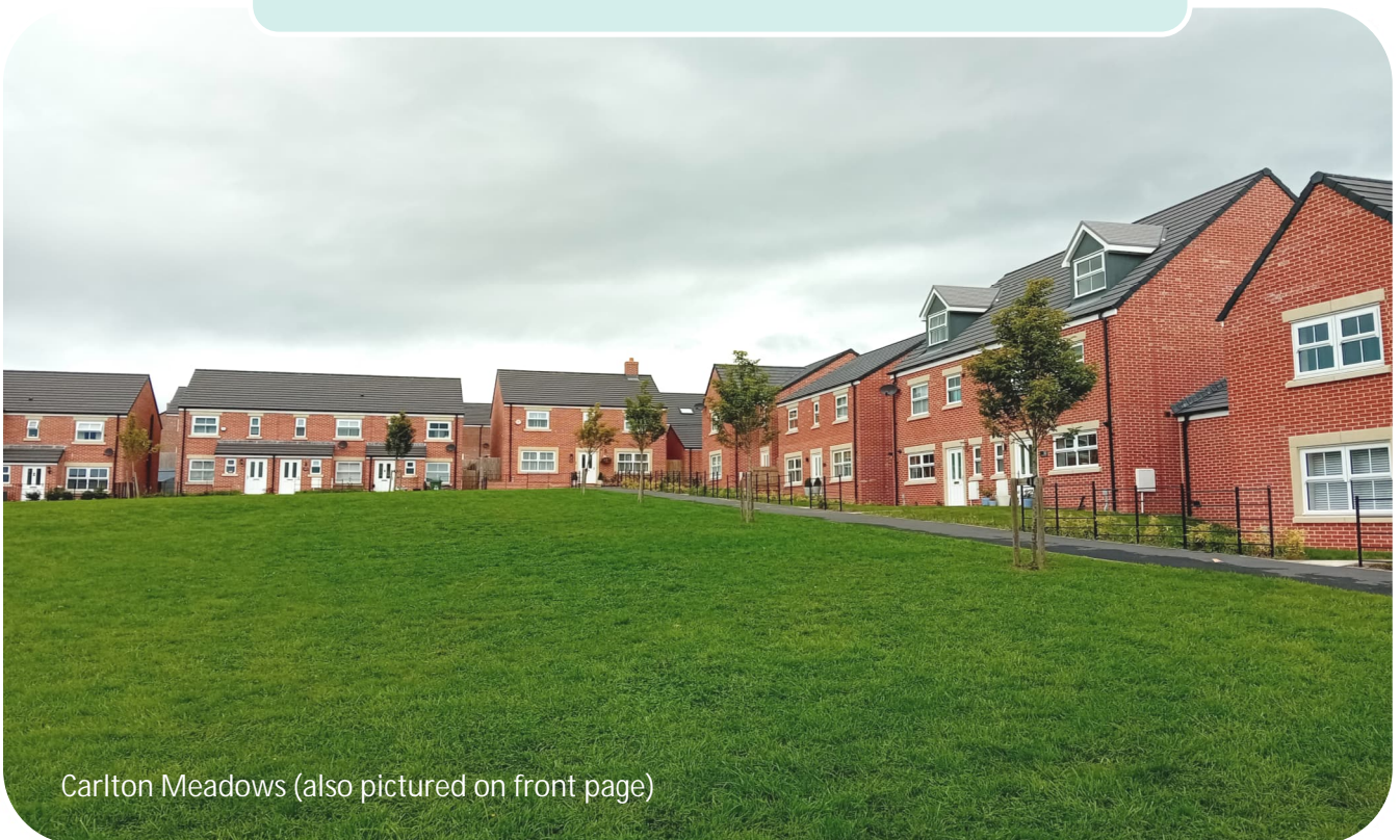
Carlton Meadows (also pictured on front page)

This Policy applies to all applications to Westmorland and Furness Affordable Housing Fund Grant.